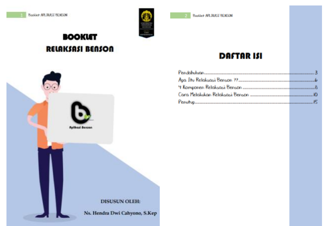
Figure 2 Benson relaxation booklet

As data were normally distributed, paired and independent t -tests were used to analyze and determine the effect of Ben-Apps on fatigue in patients with breast cancers. All data were analyzed using SPSS version 20.